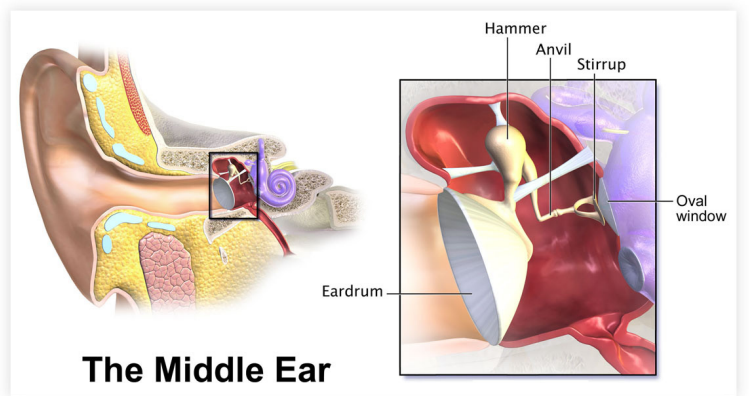
fig. 2-2 The middle ear and the three ossicles

and the oval window of the actual, fluid-filled hearing organ, we have a system of three tiny bones, or ossicles ( fig. 2-2 ). These are the malleus (or hammer), the incus (or anvil) and the stapes (or stirrup). Their function is to transform the airborne acoustic vibrations into vibrations – or waves – adapted to a liquid environment; at the same time they seem to act like something of a dynamic equalizer. The ossicles form a system of joints, complete with tiny tendons and minuscule muscles, reputedly the smallest muscles in our body.